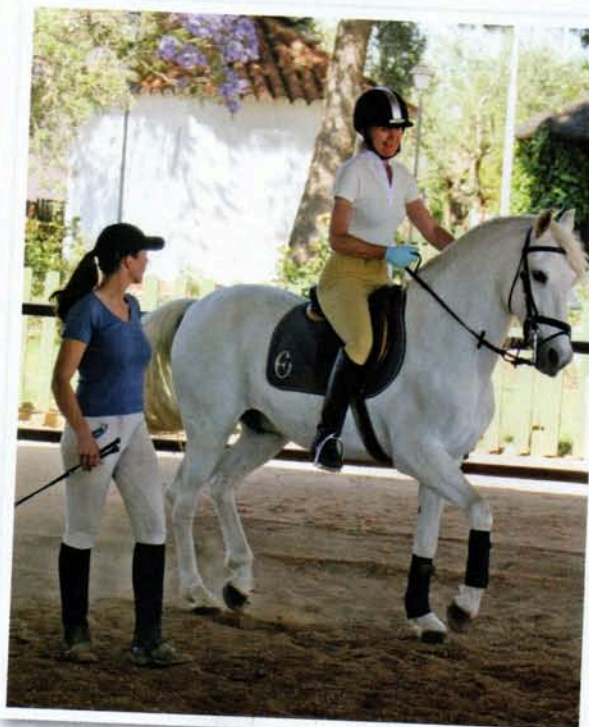
Experience classical dressage instruction on board an Andalusian schoolmaster.